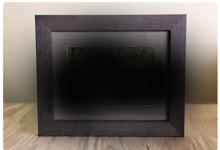
2.5 years later

Simulated depiction of average time since diagnosis of GA. Speed of progression and loss of vision will be different for every person.